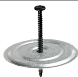
LEXCOR LEXGRIP Screws and Plates