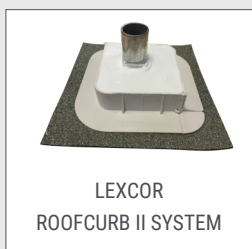
LEXCOR ROOFCURB II SYSTEM