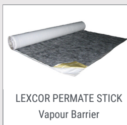
LEXCOR PERMATE STICK Vapour Barrier