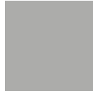
SWS08 Light Grey