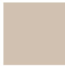
SWS14 Dolphin Grey