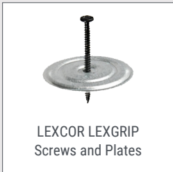
LEXCOR LEXGRIP Screws and Plates