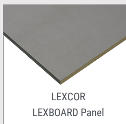
LEXCOR LEXBOARD Panel