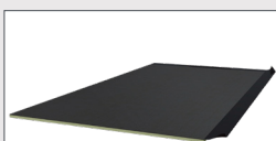
LEXCOR LEXBASE R+ Panel