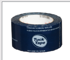
BLUE TUCK TAPE