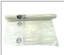
LEXCOR PE-10 VAPOUR BARRIER