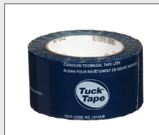
BLUE TUCK TAPE